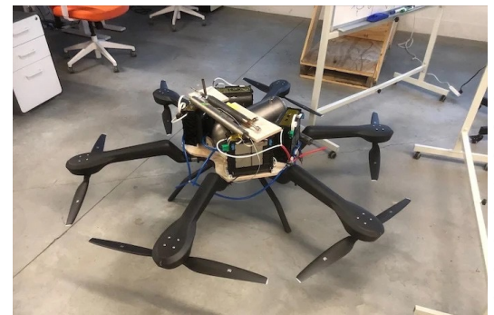
Pictured: Amogy ammonia-powered battery solution onboard a drone