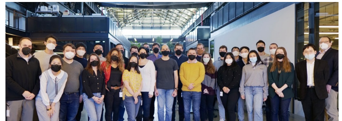
Pictured: Amogy team at Headquarters in the Brooklyn Navy Yard